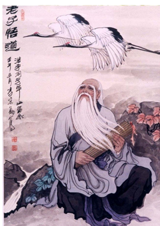
The truth of Taoism